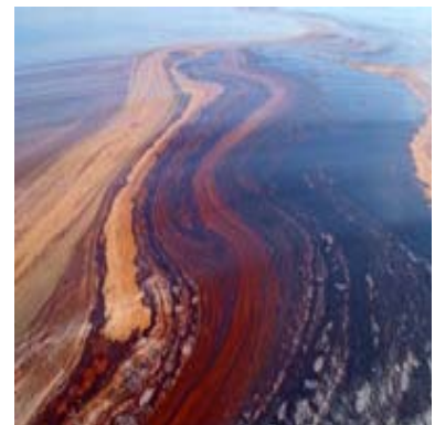
Researchers are studying oil's impact on microbial life.

To date, NSF has awarded 39 RAPID Response grants, totaling nearly $4 million, for scientific study of the gulf oil spill. For a regularly updated list of RAPID oil spill awards, see here .