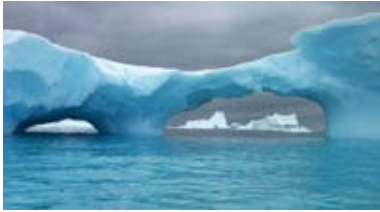
Blue arch of ice with view of icebergs, from "Ice Stories" online exhibit.

and Antarctic," showcases scientists' fieldwork in an engaging and interactive way, through webcasts, feature stories, polar news, videos and vivid images of research projects. "Ice Stories" was produced as part of the celebration of the 2007-2008 International Polar Year. NSF provided funding for the project, including cameras and blogging tools to document the fieldwork of scientists in the polar regions.